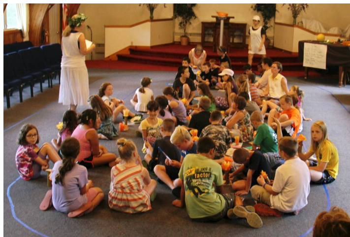
Camp H.O.P.E. Daily Closing Time in the Olympic Stadium (Our Sanctuary)